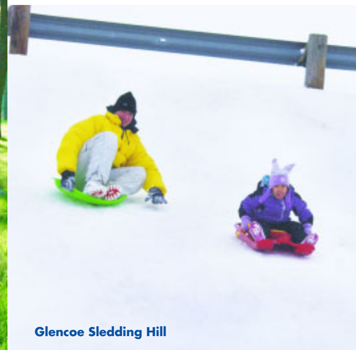
Glencoe Sledding Hill