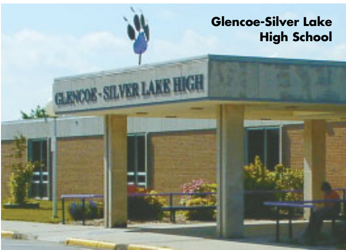
Glencoe-Silver Lake High School

Preschool through 6th Grade 1103 10th St. E., Glencoe, (N-8) 320-864-3214