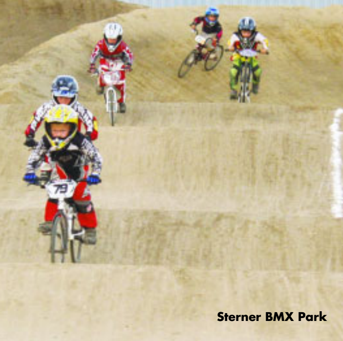
Sterner BMX Park