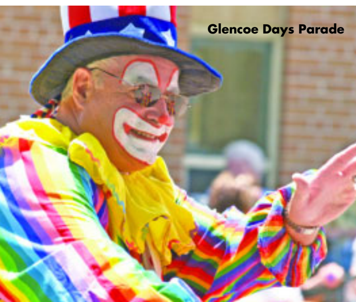
Glencoe Days Parade