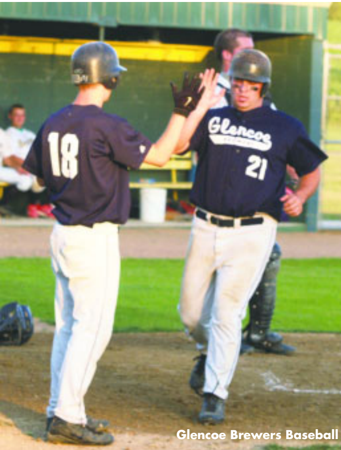
Glencoe Brewers Baseball

The field house offers racquetball, basketball courts, weight room, tennis courts, fitness area, a walking/running track, volleyball leagues, batting cage, and other activities organized by Glencoe-Silver Lake Community Education.