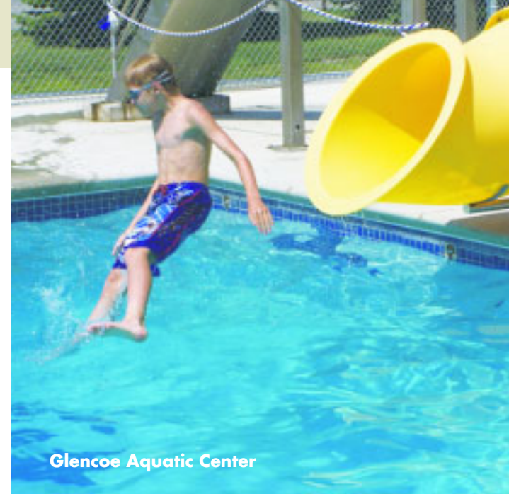
Glencoe Aquatic Center

The Buffalo Creek BMX facility offers youth bicycle riders a place to practice and compete in organized racing. The race track site is just south of NAPA/Do it Best on 9th Street. Questions about the facility can be directed to Ryan Voss at 320-864-4243.